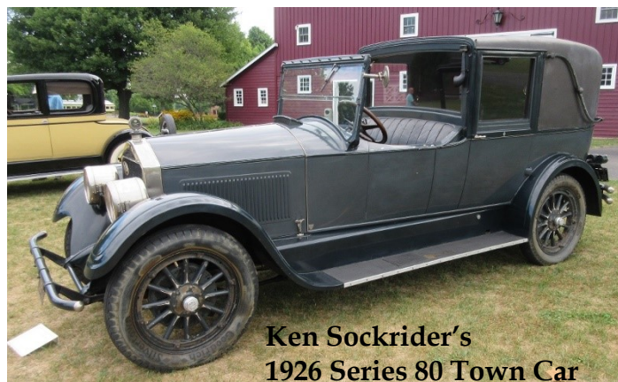
Ken Sockrider's 1926 Series 80 Town Car