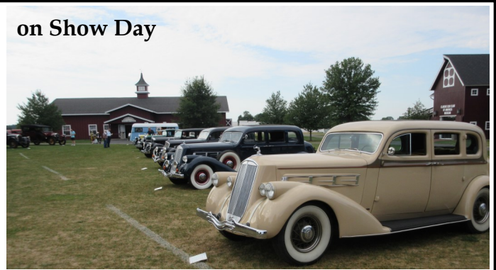
on Show Day