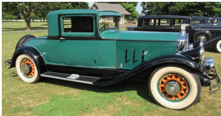
Jon Reus's 1931 Model 43 Rumble Seat Coupe