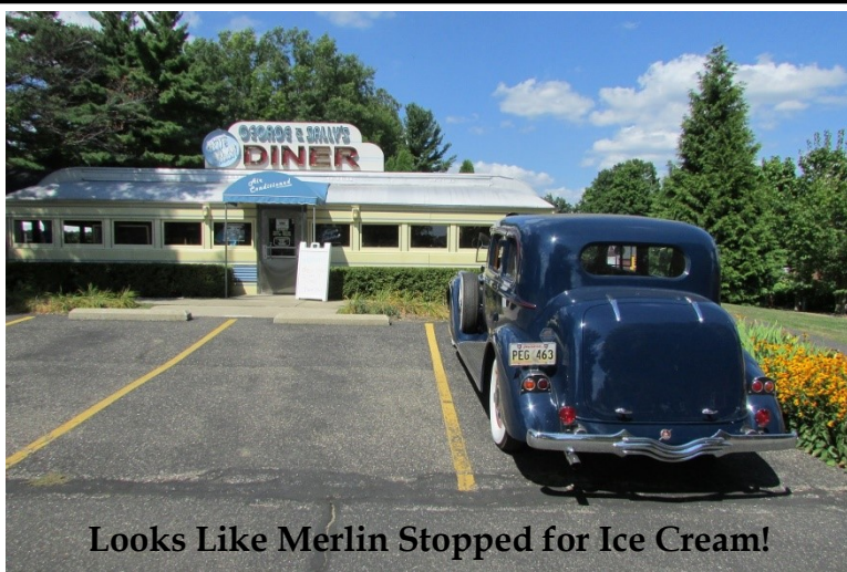
Looks Like Merlin Stopped for Ice Cream!