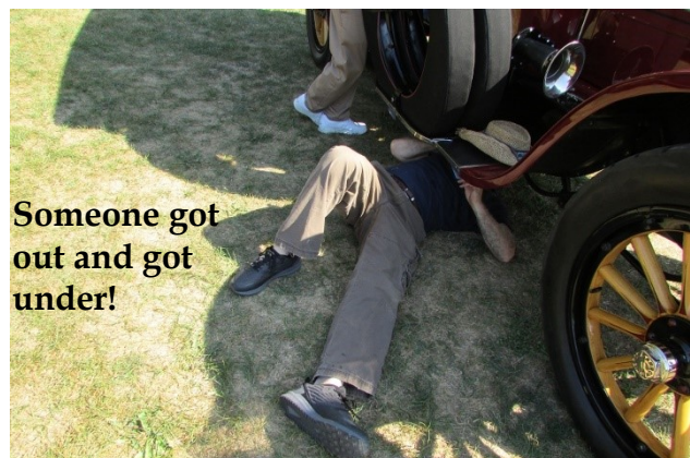
Someone got out and got under!