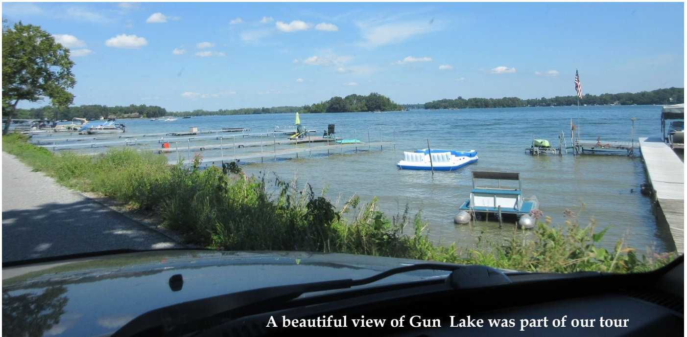
A beautiful view of Gun Lake was part of our tour

About 30 people arrived early to do a 70 mile "on your own" Saturday scenic drive around lakes on low traffic country roads with the only stop being the Gilmore car Museum.