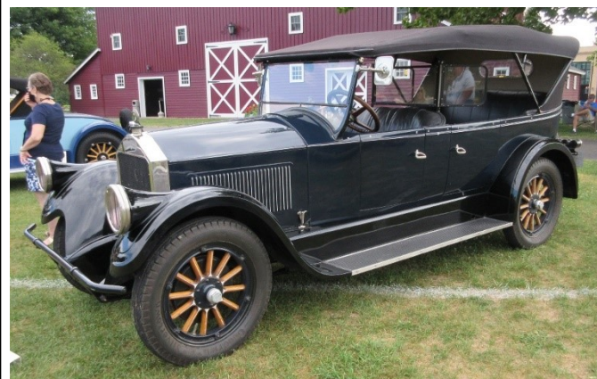
Greg Long's 1925 Series 80 Touring