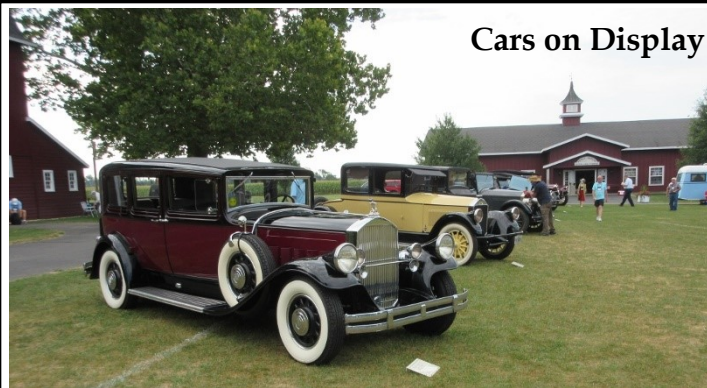
Cars on Display