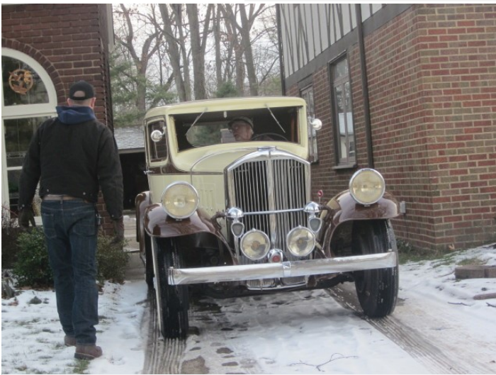
It snowed in Cleveland, OH when the car came home

Norm's comments on providing transportation for their next door neighbor's wedding are below: