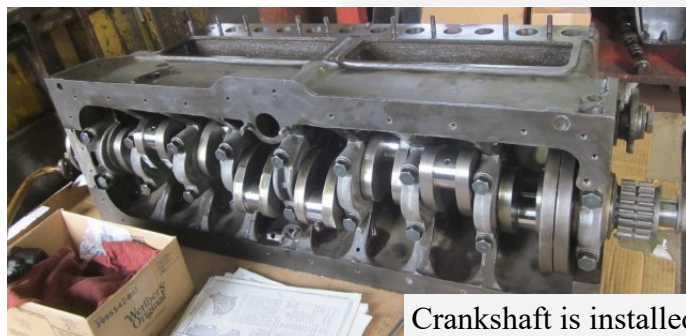
Crankshaft is installed and short block is completed