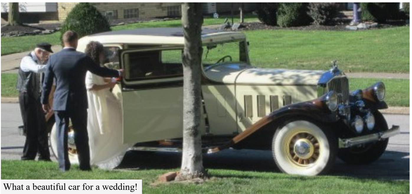
What a beautiful car for a wedding!