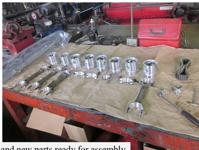
Original valve cover decal and new parts ready for assembly