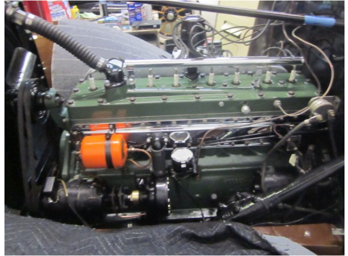
Rebuilt engine is back in the car looking like new!