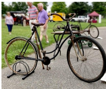
Jane Barclay's Ladies Bicycle Most Original