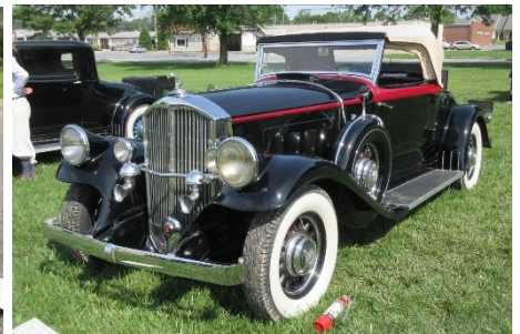
Greg Long's '32 Model 54 3rd in Class