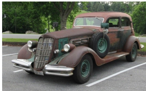
The Petersons had Air Conditioning