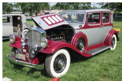
The Barclays' '32 Model 54