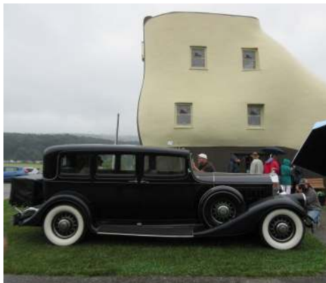
The Stevens '33 1247 at the Shoe House