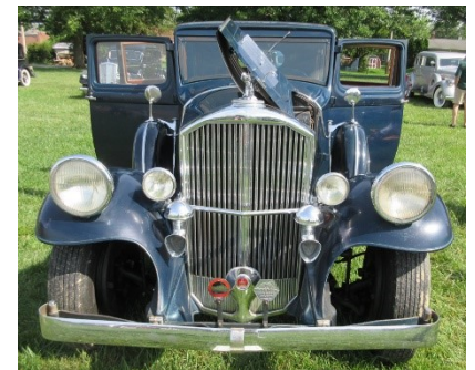
The Riggins' '32 Model 54 Sedan