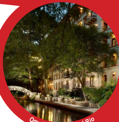
Omni La Mansión del Rio