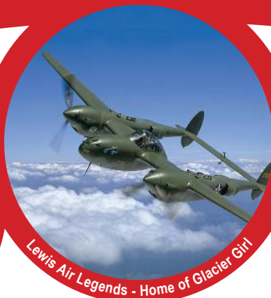
Lewis Air Legends - Home of Glacier Girl