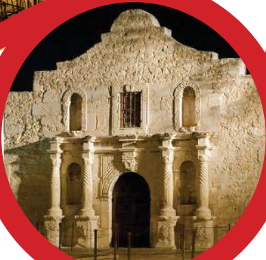
The Alamo Historic Site