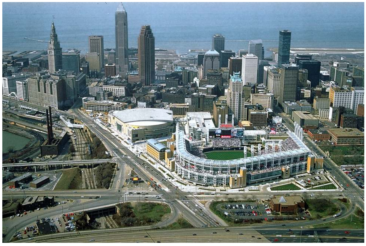
Mark your calendar for May 5-6-7, 2023, it's <u>never too early</u> to start planning to have fun!