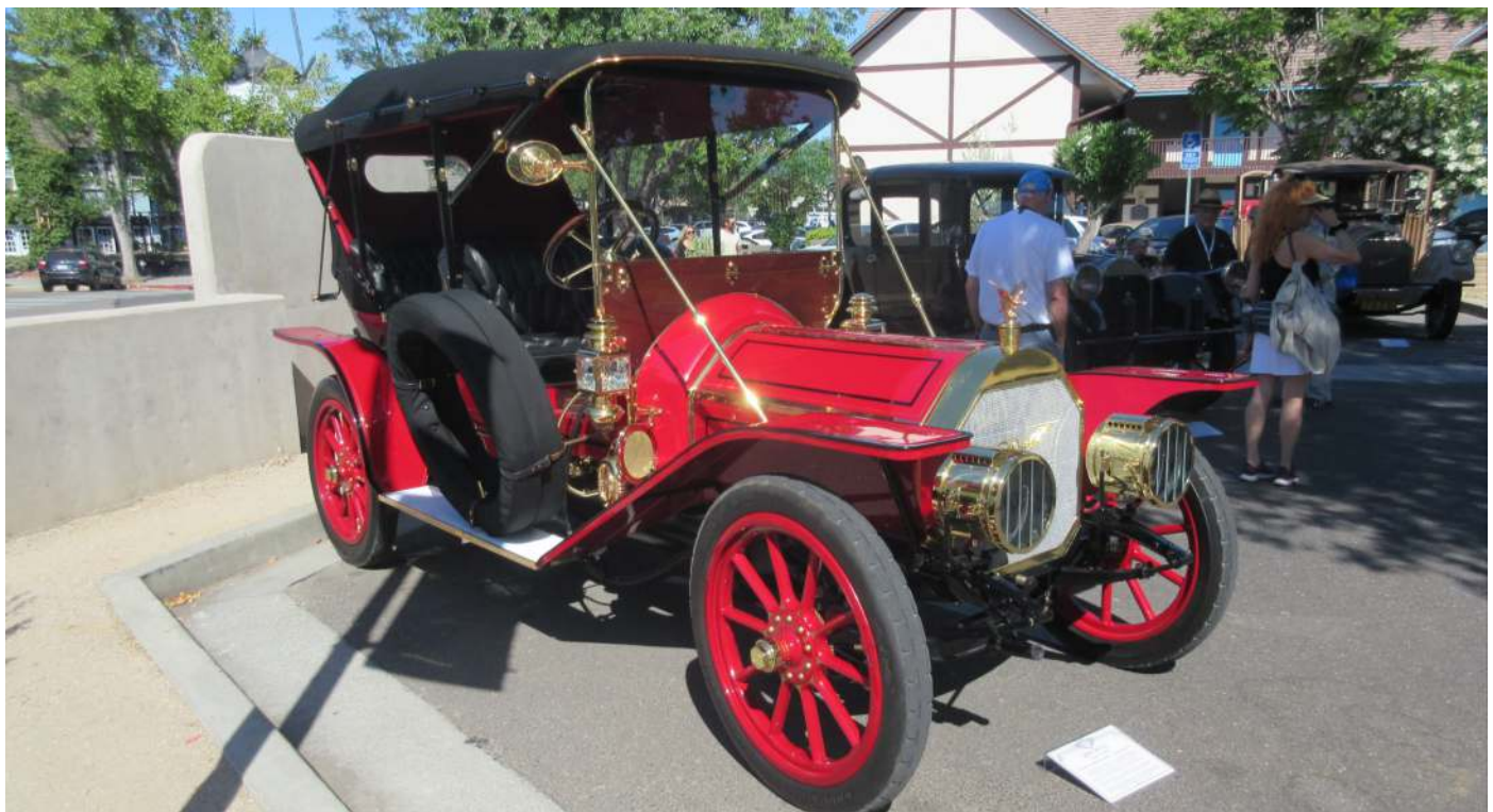
Award Winning 1909 36-UU was the oldest car at the meet.