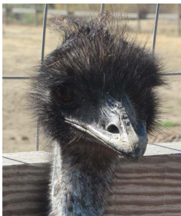
Ostrich and Emu from the FARM