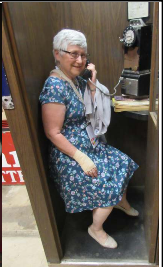
Remember Phone Booths?