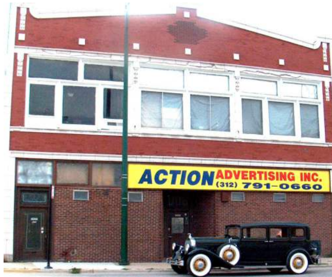
2420 S Michigan Ave. Chicago, IL

Sadly, the 2545 building was demolished to make way for the Mercy Hospital Expansion. The 2420 building still stands and is occupied by the Action Advertising Inc.